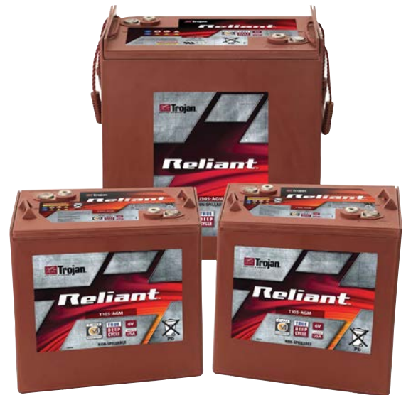
Delivering the Maximum Energy Output in AGM Technology with These Maintenance-Free Batteries.